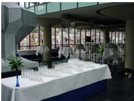
Casino Foyer (310 m 2 )