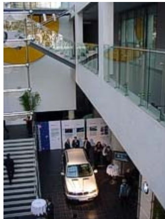
Inn Foyer (600m 2 )

Additional exhibition space is available on the ground floor in the Inn Foyer right next to the main entrance and the registration / reception desk. The Inn Foyer provides an additional 600m 2 of exhibition space.