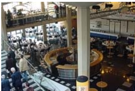
Kristall Foyer (600 m 2 )